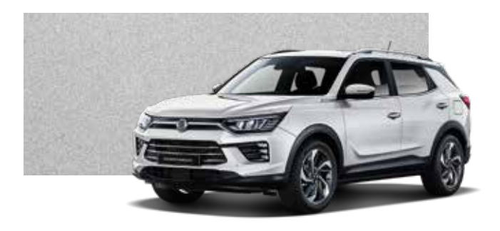
GRAND WHITE (WAA)