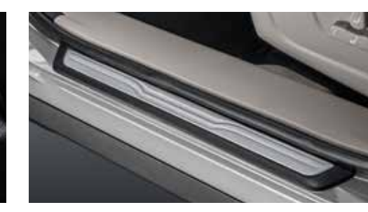
Front stainless door scuff