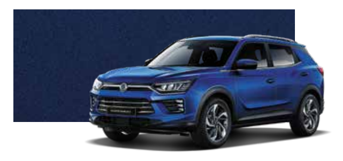
DANDY BLUE (BAS)