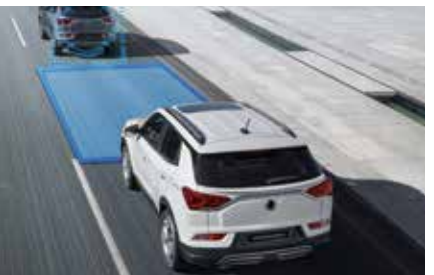
SDA (Safety Distance Alert)

When reversing and an approaching vehicle is detected in the path, RCTA sounds an alarm and automatically applies the brakes to stop the vehicle and reduce the risk of a collision.