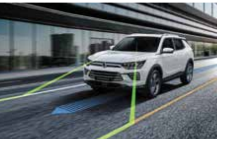
LKAS (Lane Keeping Assist System)

LKAS uses a front camera to monitor the painted lane markers. On detecting an attempt to change lanes without prior signaling, it automatically corrects the electrical power steering system to keep the vehicle within the intended lane.