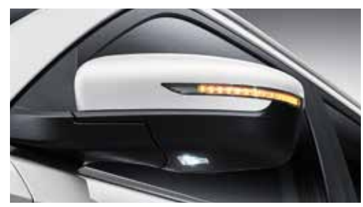
LED side repeaters and puddle lamps