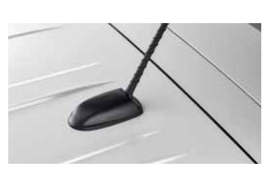
Pole antenna with Glonass, DAB and GSM