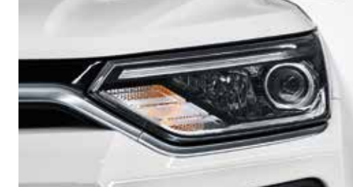
Projection headlamps with bulb-type turn signal lamps