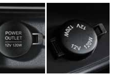
12V power socket (front/rear)