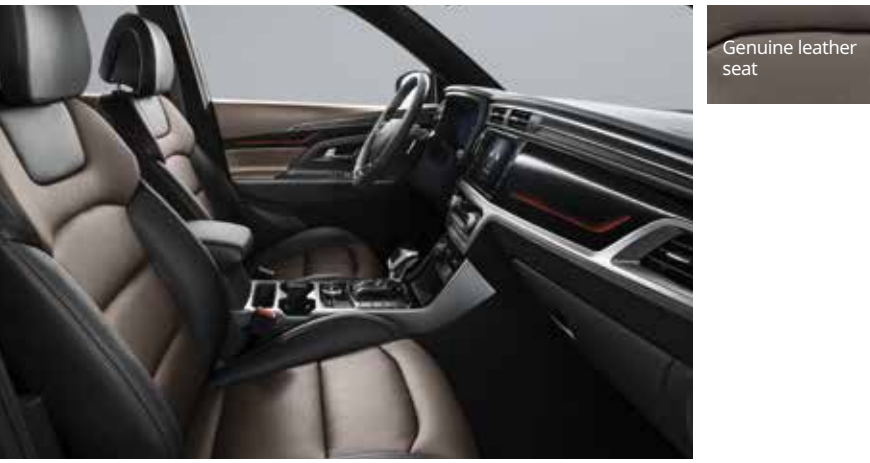
BLACK INTERIOR (LBH)

* Leather seat includes artificial leather partially