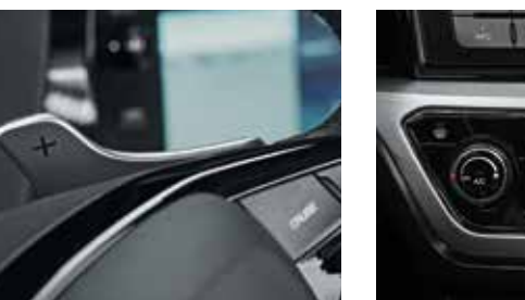
Paddle shifts with A/T