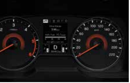
Supervision cluster (3.5" mono LCD)